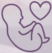
Fetal Heart Rate