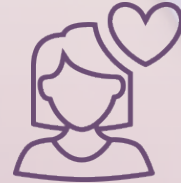
Fetal Movement Event