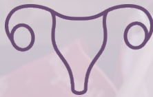
Mother's Heart Rate